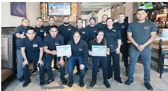
Staff of Fiesta Mexican Restaurant in Adel