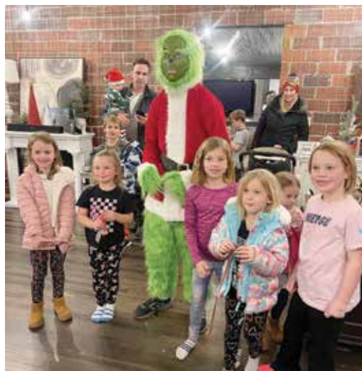
The Grinch and kids playing at Susie Sheldahl, Realty ONE Group Impact office at Light Up Polk City on Dec. 1.