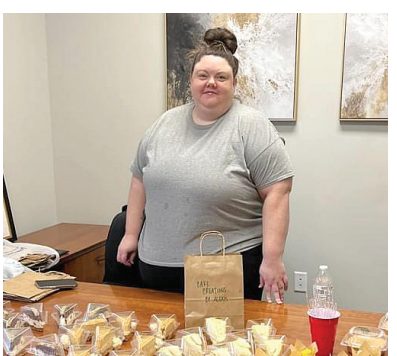
Cake Creations by Alexis, LLC