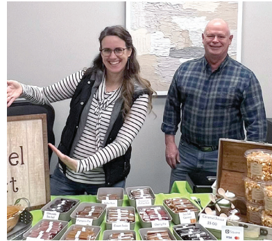
The Caramel Addict