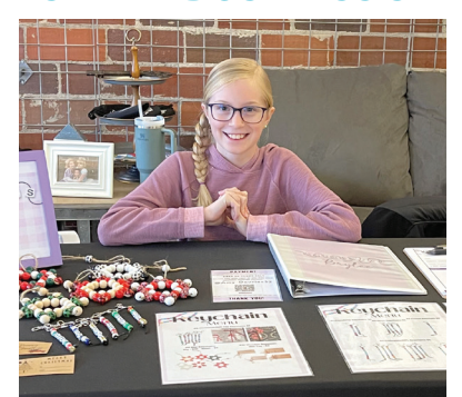
Keychains by Brylee

SMALL BUSINESS SATURDAY WAS HELD IN POLK CITY ON NOV. 25