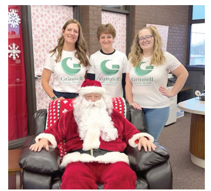
Santa and the Grinnell State Bank staff