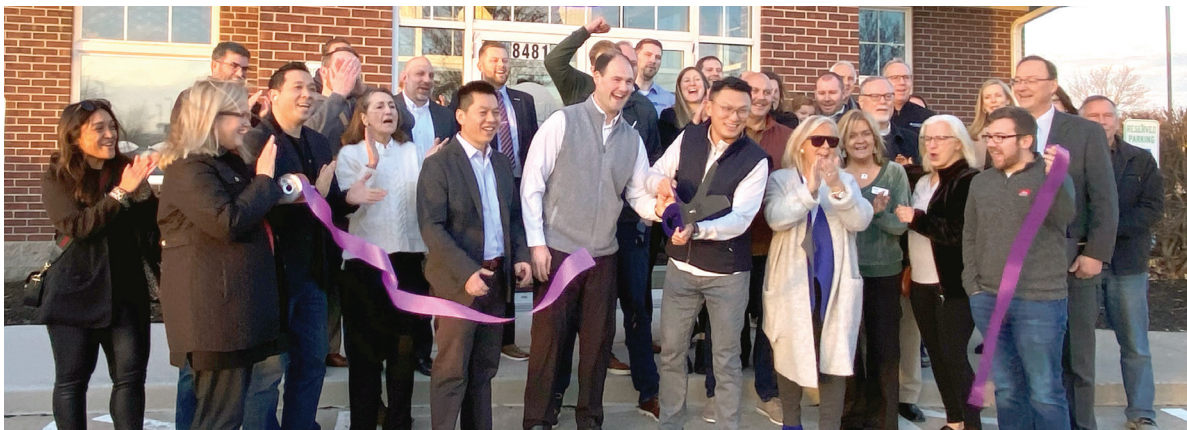
Johnston Chamber of Commerce held a ribbon cutting for Wasabi at its new location, 8481 Birchwood Court, Johnston, on Dec. 19.