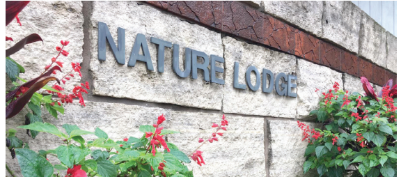
Wonder Palace Nature Lodge