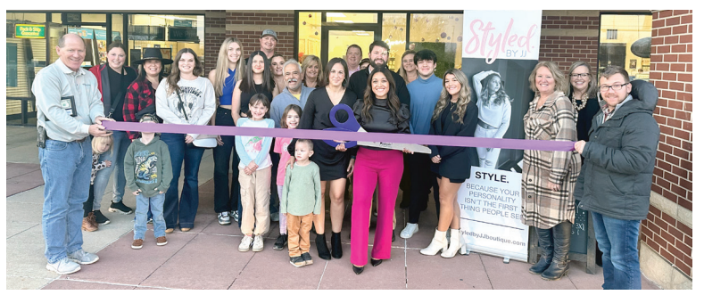
RIBBON CUTTING FOR STYLED BY JJ: The Johnston Chamber held a ribbon cutting for Styled by JJ on Nov. 29. ■