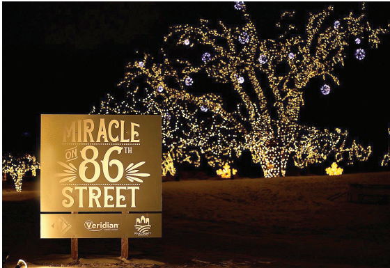
Miracle on 86th Street