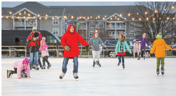
Free ice skating was enjoyed at The Yard.