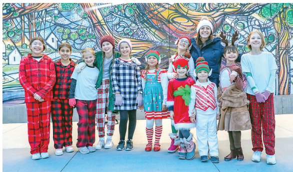
Among the performers were members of Dancer's Theatre/Midwest Youth Performing Arts Center. ■