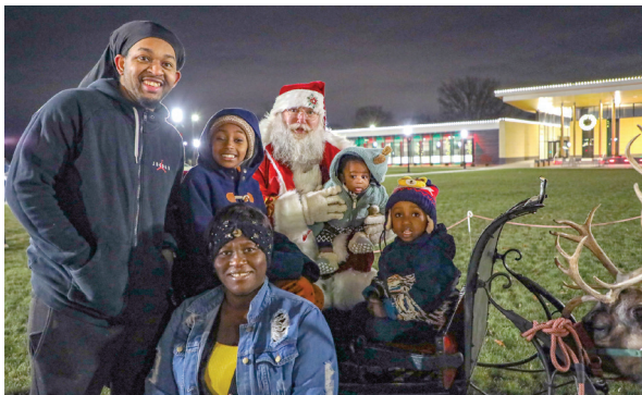
Santa and his reindeer were on hand to visit with families.

A variety of festivities were held at the Johnston Town Center to celebrate the holiday season. Many businesses and organizations participated in the event including Dancer's Theatre/Midwest Youth Performing Arts Center, Dunkin' Donuts, Unaccompanied Minors, Northpoint Church, Johnston Public Library, First Baptist Church and Neon Heart Salon. Businesses in the Town Center offering specialty items during the event included Backpocket Pin & Pixel, Blue Bean, and The Cork 50131. ■