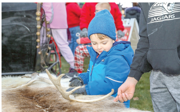
Among the activities offered for children was the chance to feel animal fur.