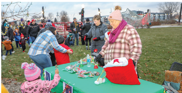
Tables of goodies and activities were set up in The Yard for kids.