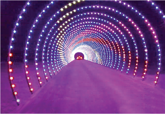
Santa's Rock N Lights