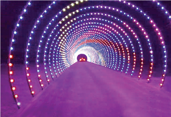
Santa's Rock N Lights