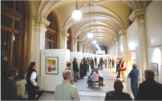
GREATER DES MOINES EXHIBITED.

EMAIL YOUR EVENT INFORMATION TO TAMMY@IOWALIVINGMAGAZINES.COM