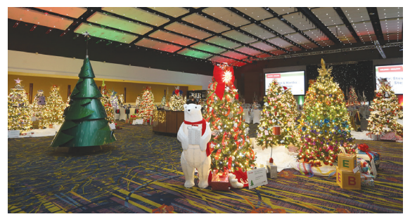
FESTIVAL OF TREES & LIGHTS.