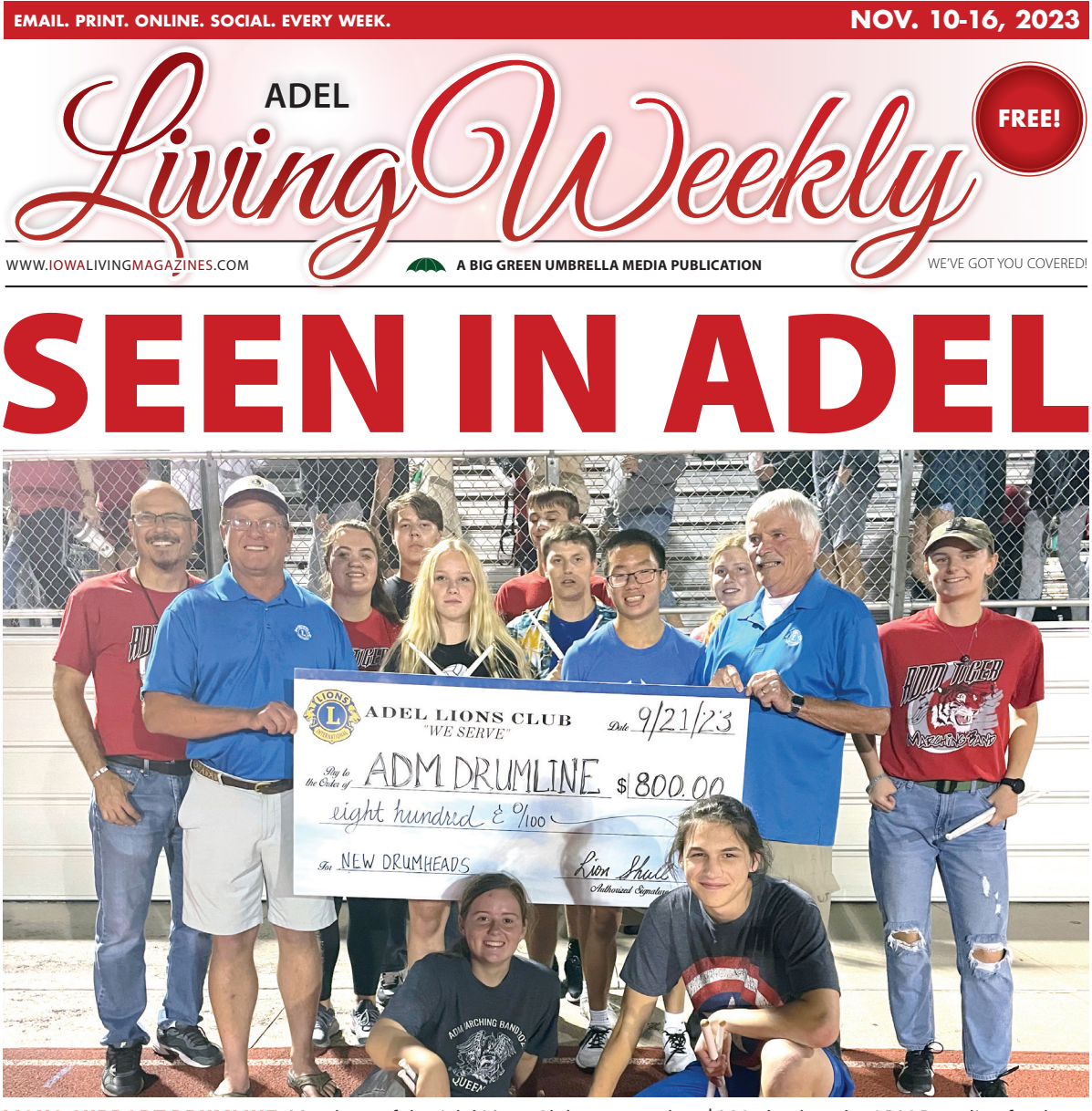
LIONS SUPPORT DRUMLINE: Members of the Adel Lions Club presented an $800 check to the ADM Drumline for the purchase of new equipment on Sept. 21.