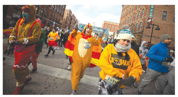
DES MOINES TURKEY TROT.

Des Moines' best artists return to display the highest quality artwork the city has to offer. The annual show features artists' work that was blindly juried by Edgard Camacho.