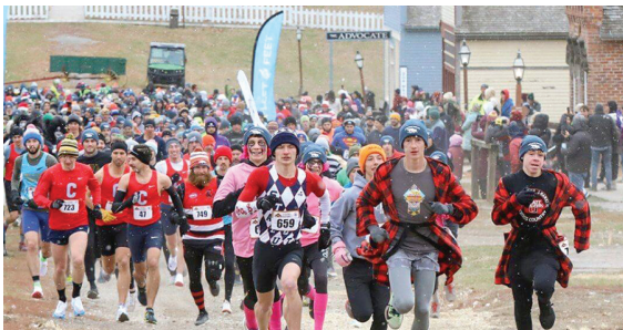
Living History Farms race

NOV. 12: Jazz at Caspe Terrace by Sparks. From 2-4:30 p.m. at 33158 Ute Ave., Waukee; jewishdesmoines.org/our-community/caspe-terrace .