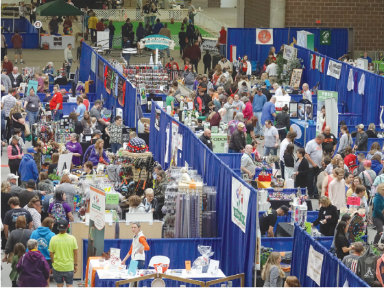
Great Iowa Pet Expo.