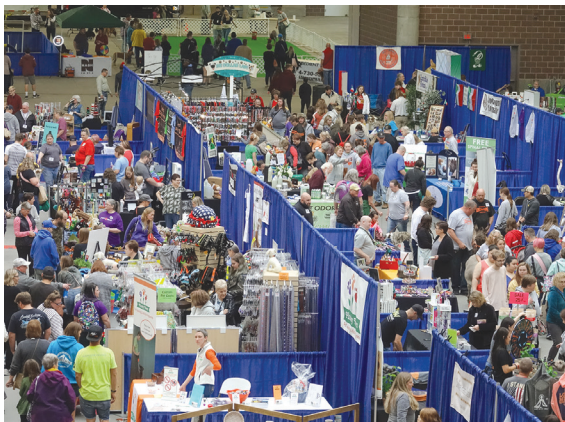
Great Iowa Pet Expo.