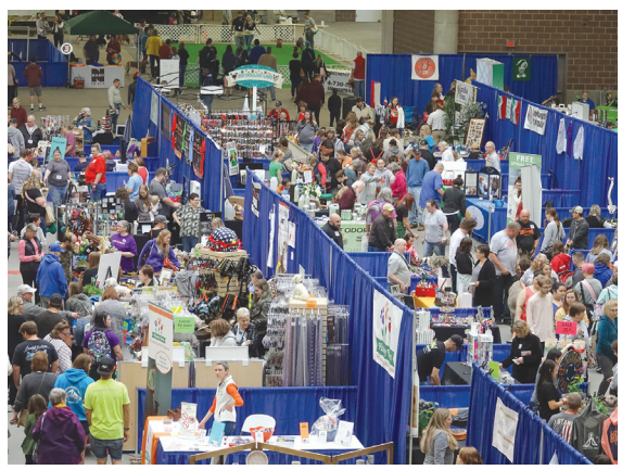
Great Iowa Pet Expo.