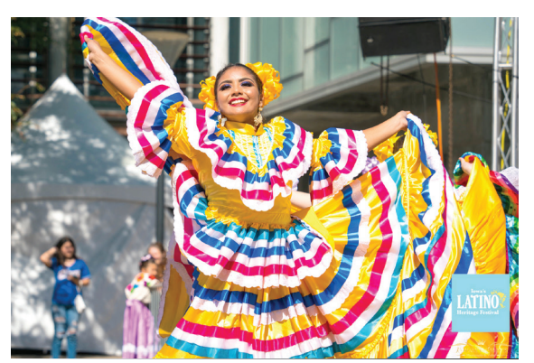
Latino Heritage Festival