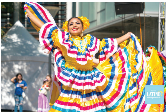
Latino Heritage Festival

EMAIL YOUR EVENT INFORMATION TO TAMMY@IOWALIVINGMAGAZINES.COM