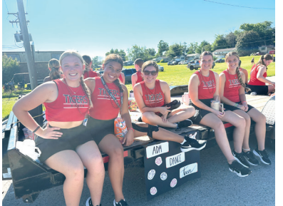
ADM Dance Team