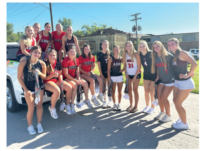
ADM Girls Varsity Athletes