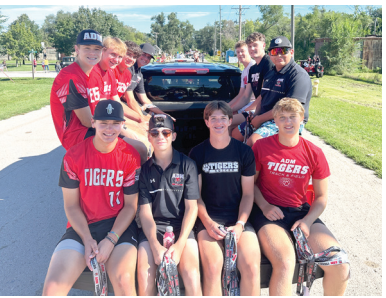
ADM Boys Varsity Athletes