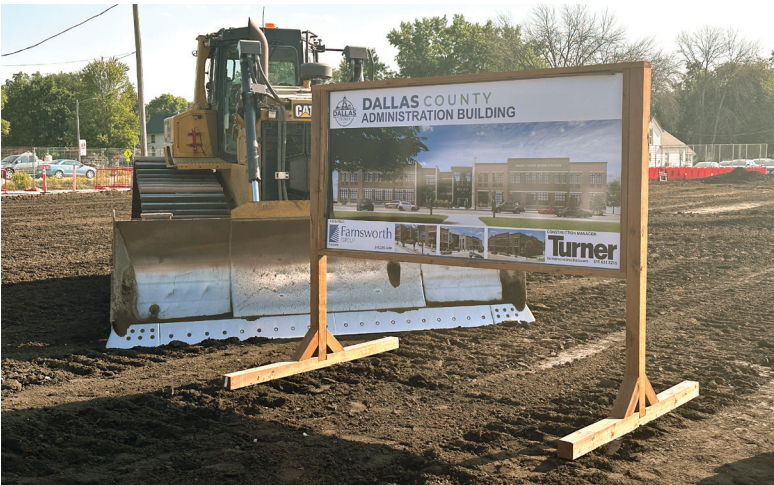
Artist's rendering of the new building