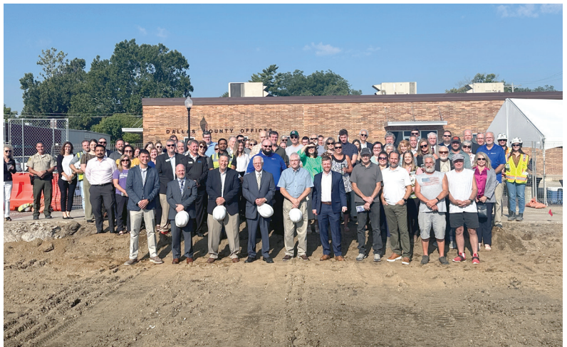
Several local and county officials, as well as the general public, attended the groundbreaking ceremony for the new Dallas County Administration Building.

special collection area to preserve and protect the most historic and important county documents.