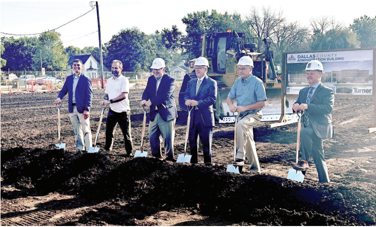
Officials break ground on the new Dallas County Administration Building.