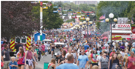
The Iowa State Fair