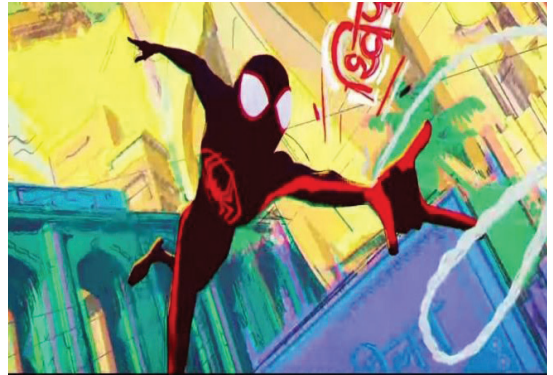
"SPIDER-MAN: ACROSS THE SPIDER-VERSE"

In 2018 we were "Into the Spider-Verse," this year we are "Across the Spider-Verse" and in May of 2024 we will be "Beyond the Spider-Verse." So the 2023 chapter, "Across the Spider-Verse" is obviously the middle story in a trilogy. Knowing that makes it a lot easier to not completely understand everything that is going on in the film. This is Marvel Comics' multi-verse where different Spider-Men from a lot of universes collide in one. If you saw the first film, that makes sense. If you didn't, you need to catch up on these very well made films with well told stories. Grade: B+