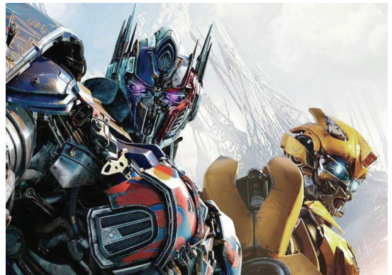
"TRANSFORMERS: RISE OF THE BEASTS"

This is an entertaining and well-made movie that made almost no sense to me whatsoever. There was enough action and humor for two films, but maybe that's OK. My kids grew up with these Transformer things, so I'm not exactly the target audience, but I was mildly entertained. Grade: B-