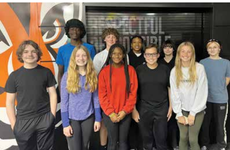
Members of the Leadership Group at Indian Hills Junior High are building skills to take on leadership roles at the school

Indian Hills Junior High students gain confidence.