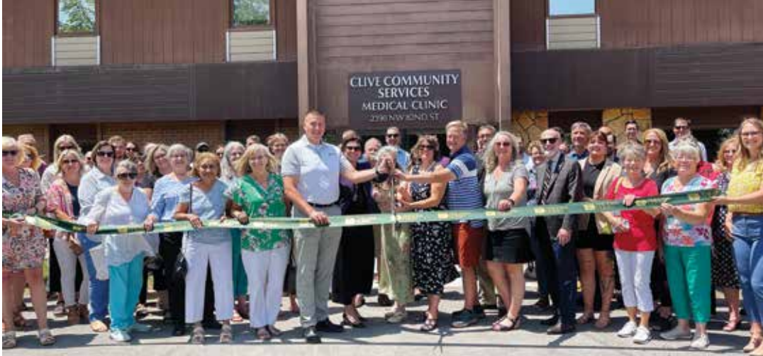
A ribbon cutting for the Clive Community Services Medical Clinic was held June 13.