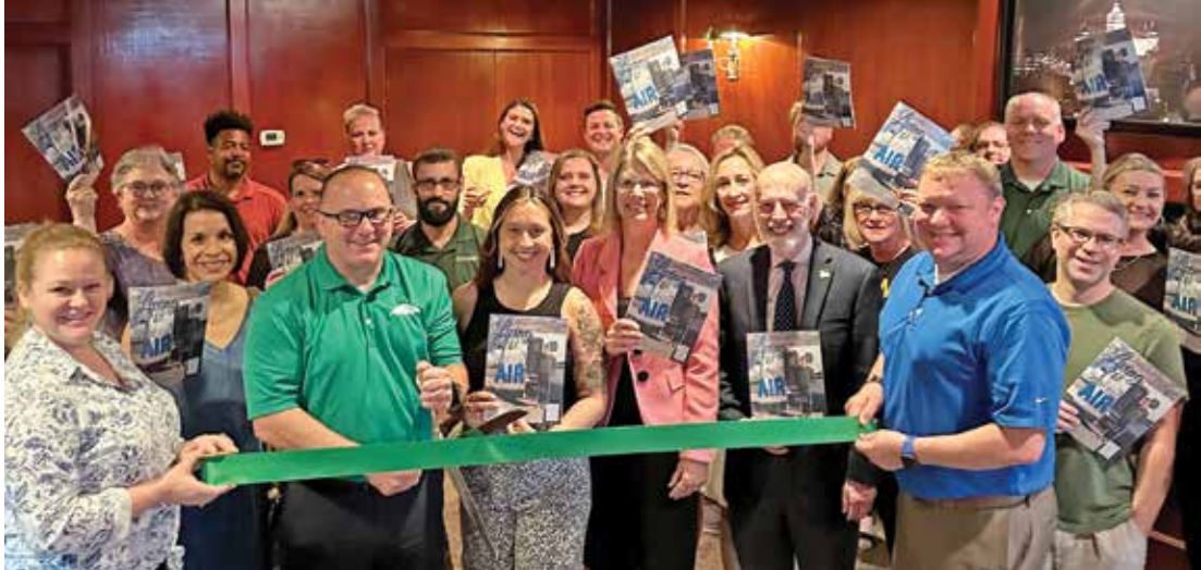
A Clive Chamber of Commerce ribbon cutting was held at the Big Green Umbrella Media launch party for its Clive Living magazine on May 24 at Nick's Bar & Grill.

Big Green Umbrella Media held a re-launch party for its Clive Living magazine on May 24 at Nick's Bar & Grill.