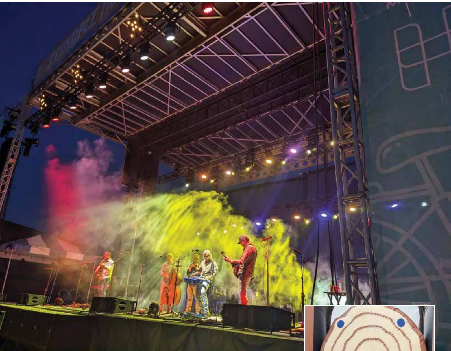
The Infamous Stringdusters perform.

The inaugural Greenbelt Music Festival raised $8,885 for the Greenbelt Landing Project. For every ticket sold, the Horizon Events Center donated $5 to the Clive Community Foundation (CCF) for the project.