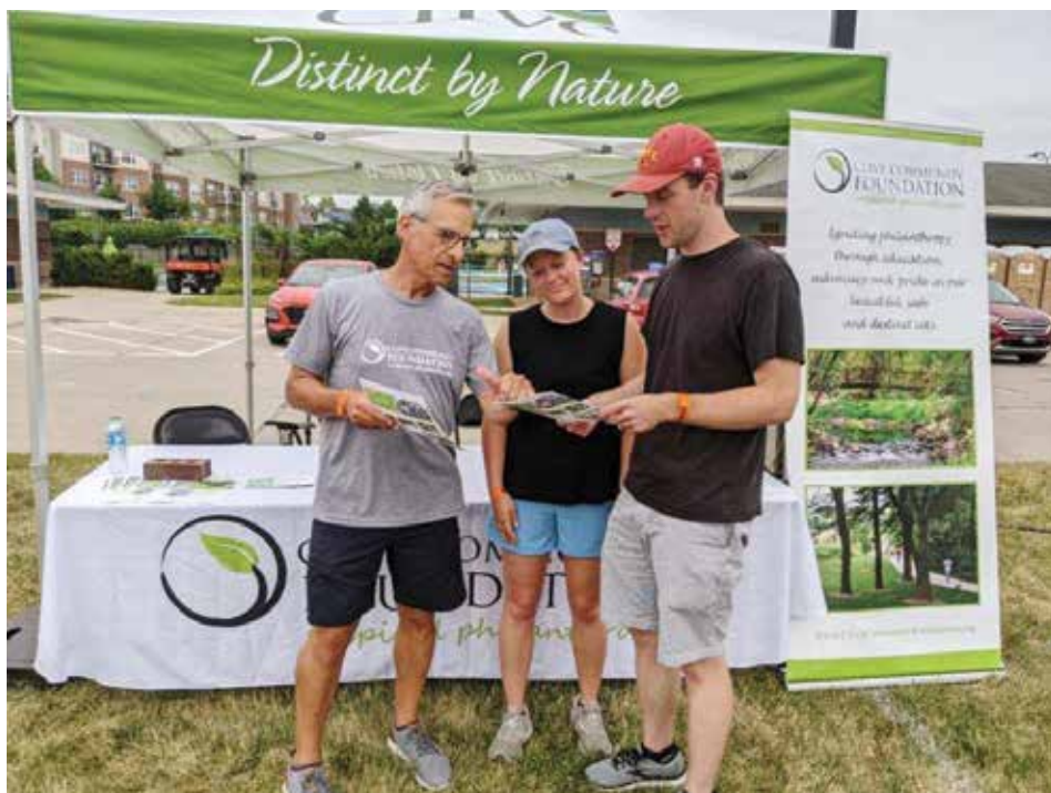
Visit the Clive Community Foundation booth and other vendors at Clive Festival.

The event requires many volunteers to make for a successful couple of nights in late July. The organizers wish to thank all the volunteers for helping put on Clive's largest annual community gathering. Volunteers are still needed, and those interested are encouraged to sign up at https://signup.com/go/jivaarY .