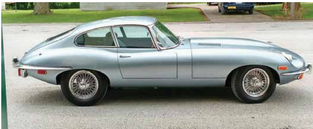
Chuck Leibold's 1969 XKE Jaguar.