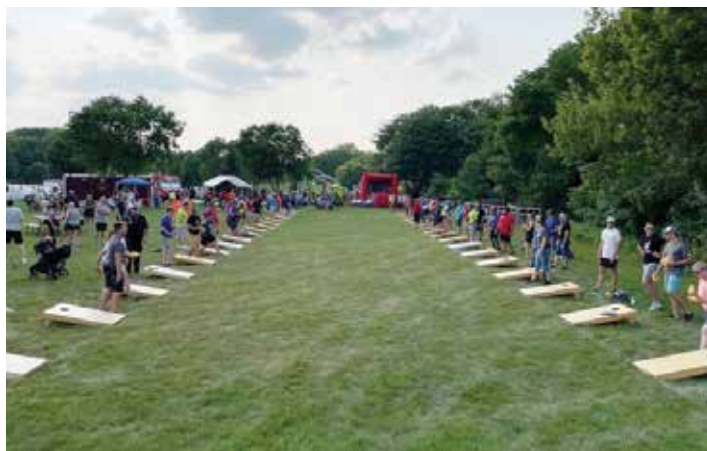
Clive Festival again features a bags tournament.

This popular trail is used year-round by runners, walkers and bicyclists. Proceeds from the race are used for trail improvements, such as the new drinking fountains installed from past races and the annual maintenance of the trail.