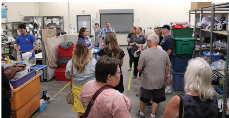
The public tours the Goodwill of Central Iowa Headquarters and Training Center in Johnston.

Event attendees were given a behind-the-scenes look at Goodwill where they were able to track the life cycle of a donation. From donation door, to sales floor, to outlet bin, and through the recycling and salvage processes, Goodwill of Central Iowa diverted more than 17 million pounds of household items and clothing from local landfills in 2022 alone. By offering the opportunity to extend product life cycles, Goodwill of Central Iowa is effectively maximizing the impact of each donation while decreasing the