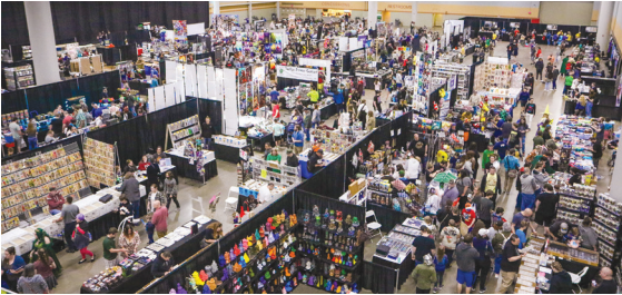
Des Moines Con.