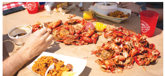
Cajun Fest.

Cajun delights make their way into downtown Des Moines with a spicy food contest, mask making, costume contest, live music and all the Cajun food your heart desires. www.cajunfestiowa.com/cajun-fest-2023 ■