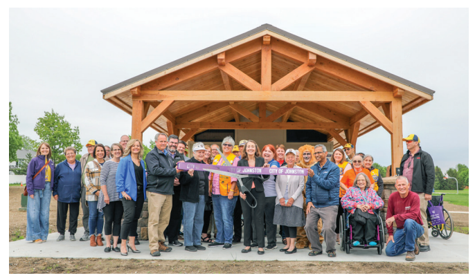
LIONS CLUB SHELTER HOUSE: A ribbon cutting was held May 15 to celebrate the completion of the Lions Club Shelter House at Johnston Commons Park.