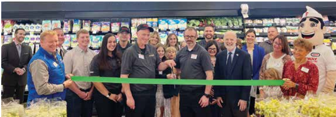
A ribbon cutting was held at the new, west Clive Fareway location on May 15.

Fareway celebrates 85 years with new, west Clive location on May 15.