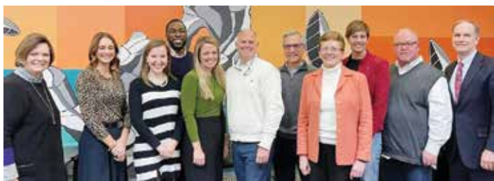
The Clive Community Foundation Board encourages philanthropy to support community organizations that improve residents' lives.