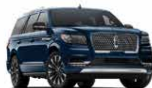
2023 Lincoln Navigator