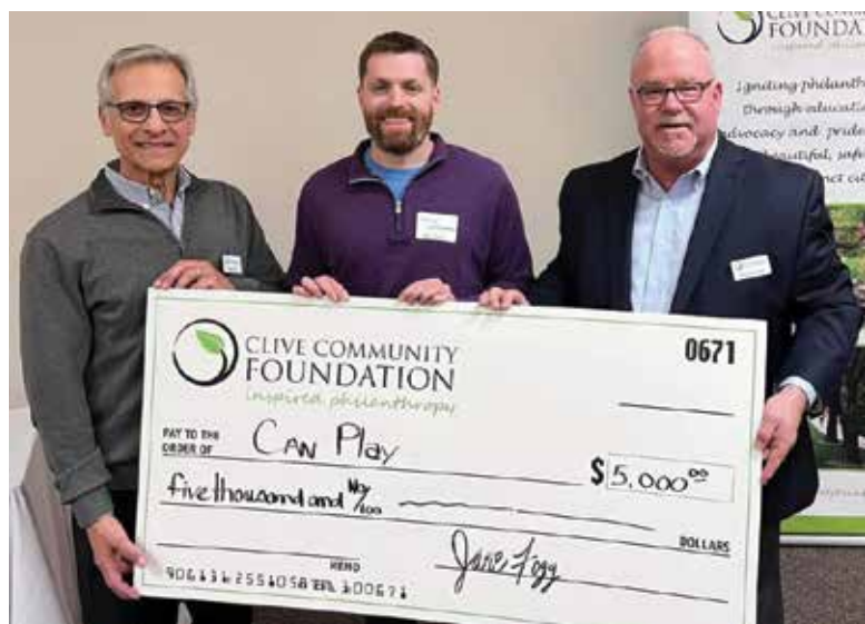
The Clive Community Foundation presented $40,000 to nonprofits last year. A $5,000 donation was made to Can Play.