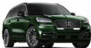
2023 Lincoln Aviator

Breathe in the beauty of the outside world. The panoramic Vista Roof spans both rows of seating, allowing for abundant sunshine and refreshing breezes. The front roof panel is powered for easy opening and closing and includes a power sunshade to help keep the interior cool and comfortable on warmer days. Elevate your journey and take in the scenery.