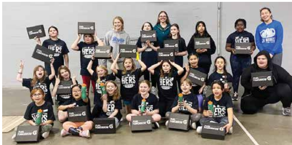
With the support of CCF, Can Play introduced a new, all-girls camp, HERS (Health, Empowerment, Respect, Soccer).

CCF also strives to raise awareness about some of the great things these organizations are doing in the community. Can Play is doing amazing work by providing no-cost recreational programs for thousands of kids in Clive and the Greater Des Moines area. With the support of CCF, they introduced a new, all-girls camp, HERS (Health, Empowerment, Respect, Soccer).