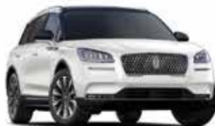
2023 Lincoln Corsair