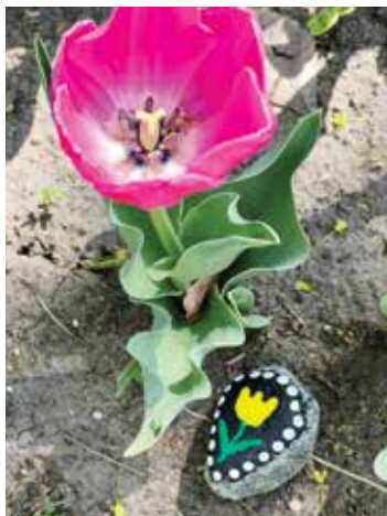
This rock with a tulip painted on it was "hidden" near a tulip.