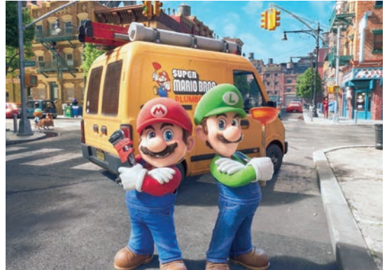
"SUPER MARIO BROTHERS"