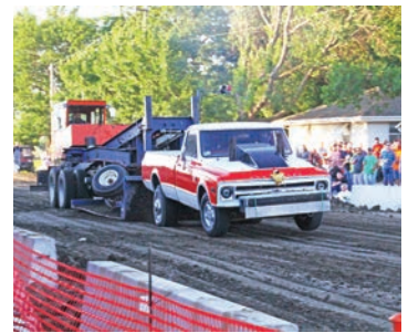
The truck pull is a highlight of the Elkhart City Festival.