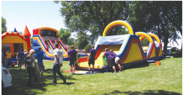
Kids activities at Elkhart City Festival include a bounce house.

Volunteers, sponsors and vendors still have time to sign up. For more information, search Facebook for the Elkhart Community Betterment Committee site. ■