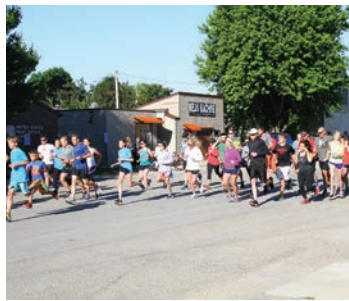
A 5K run/walk will be held at the Elkhart City Festival.