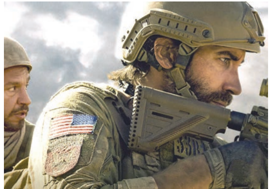
"GUY RITCHIE'S THE COVENANT"

With "Operation Fortune" a couple of months ago, "Guy Ritchie" has turned in two of the most enjoyable movies of the year to date. This one follows an American soldier in Afghanistan who is injured and flown home to recuperate. When he finds that his former Afghan translator is in hiding and being hunted, he takes it upon himself to go back and save him. Jake Gyllenhaal brilliantly plays this soldier, and the movie is really emotional and entertaining. It is a really strong story about two men thrown together by fate. Grade: A-