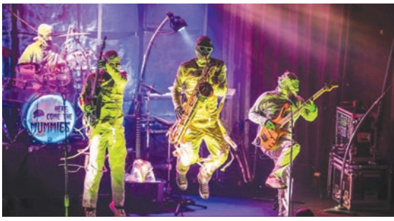
Greenbelt Music Festival

May 19-20: Greenbelt Music Festival in Clive just off the Greenbelt Trail will feature headliners Jameson Rodgers and The Infamous Stringdusters to kick off