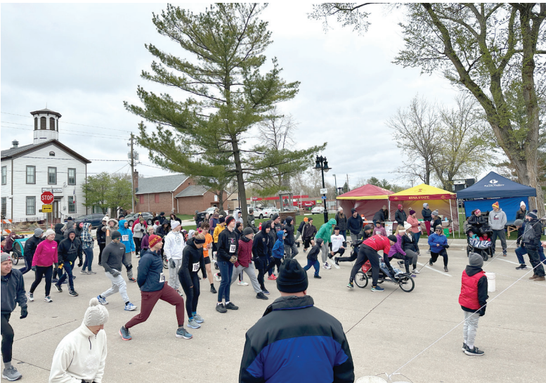
The Earth Day 5K drew a crowd for the fundraising event.

Sheldahl United Methodist Church, Sixth and Hubbell, is holding a garage sale and bake sale in conjunction with the Slater Citywide Garage Sales on Saturday, June 3, 9 a.m. to 1 p.m. Garage sale items are sold for a freewill donation. Items include a lot of denim rag rugs. A bake sale is also planned. Free coffee and bottled water will be available. ■