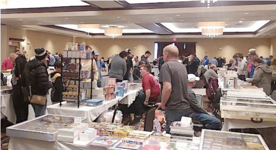
Des Moines Regional Sports Card Show