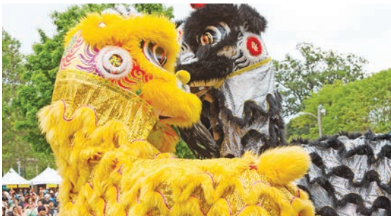
CelebAsian

Celebrate the largest Asian American event in Iowa as this festival will bring a wealth of Asian history, food, performances and other activities to Downtown that will allow all to experience everything that Asian culture has to offer.