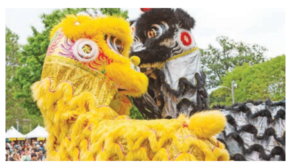
CelebrAsian

Celebrate the largest Asian American event in Iowa as this festival will bring a wealth of Asian history, food, performances and other activities to Downtown that will allow all to experience everything that Asian culture has to offer.