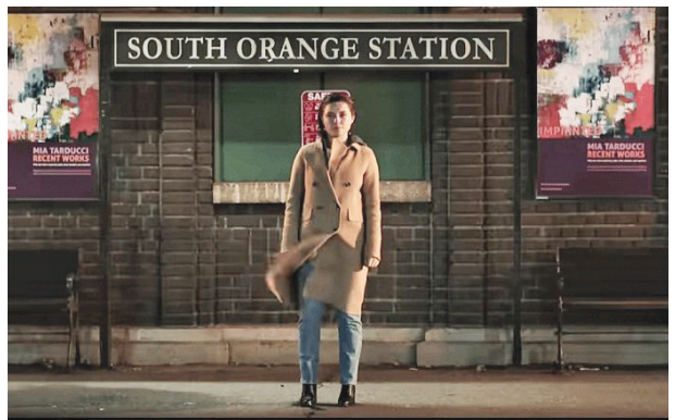
"A GOOD PERSON"

Writer/director Zach Braff gives us a look at a young woman whose life is thrown into chaos after a fatal car accident. Florence Pugh plays the young woman who spirals into substance abuse and depression. Morgan Freeman (always good) plays a man who tries to help. Difficult to watch at times but still very well done, and the acting is top-notch. Grade: B- ■