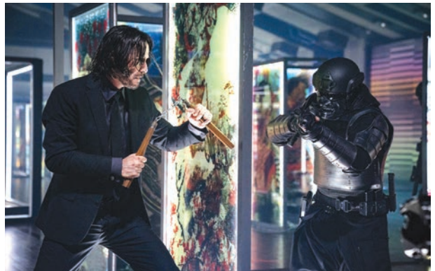
"JOHN WICK: CHAPTER 4"

Keanu Reeves is back as the man on the run from a group of evil bad asses looking to kill him. I enjoyed the first film, but the sequels went downhill from there. This is an action-filled, nearly-three-hour bloodbath. The sequences are brilliantly choreographed, but the plot is mind-numbing and even the action, toward the end, is too over the top. The ending is a relief, but I was less than thrilled with JW 4. Grade: D