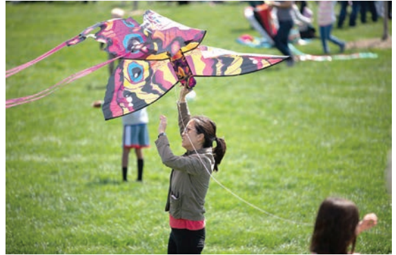
Kites on the Green