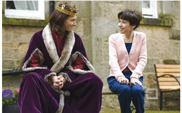
"THE LOST KING"

This might be the find of the month. Sally Hawkins plays a woman in a dead-end relationship who, after seeing Shakespeare's "Richard III," is inspired to learn more about him. She is amazed at how little is known about the former King of England, and she takes it upon herself to help right this wrong. Based on a true story, this is a wonderful film. Grade: B+