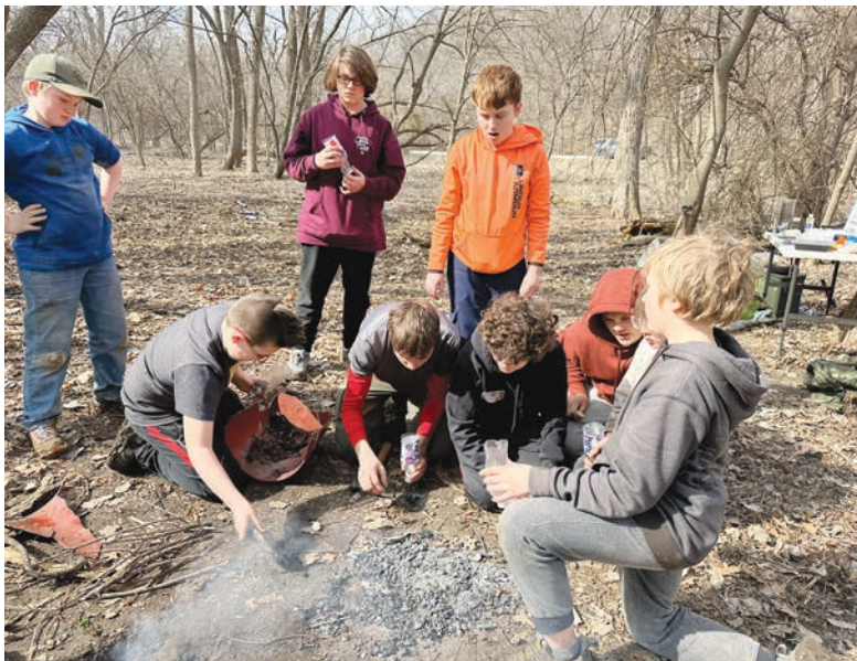
Adel Boy Scout Troop 152 camped at the Raccoon Valley Sportsman's Club from March 24-26. The Boy Scouts learned about hiking, fire building, cooking and water purification at Scout camp.