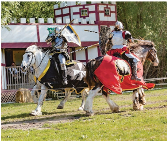
Renaissance Faire at Sleepy Hollow