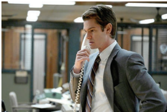
"Under the Banner of Heaven"