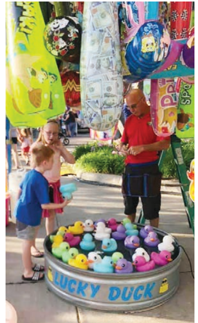
Kids "pick a duck" for prizes at Summerfest.