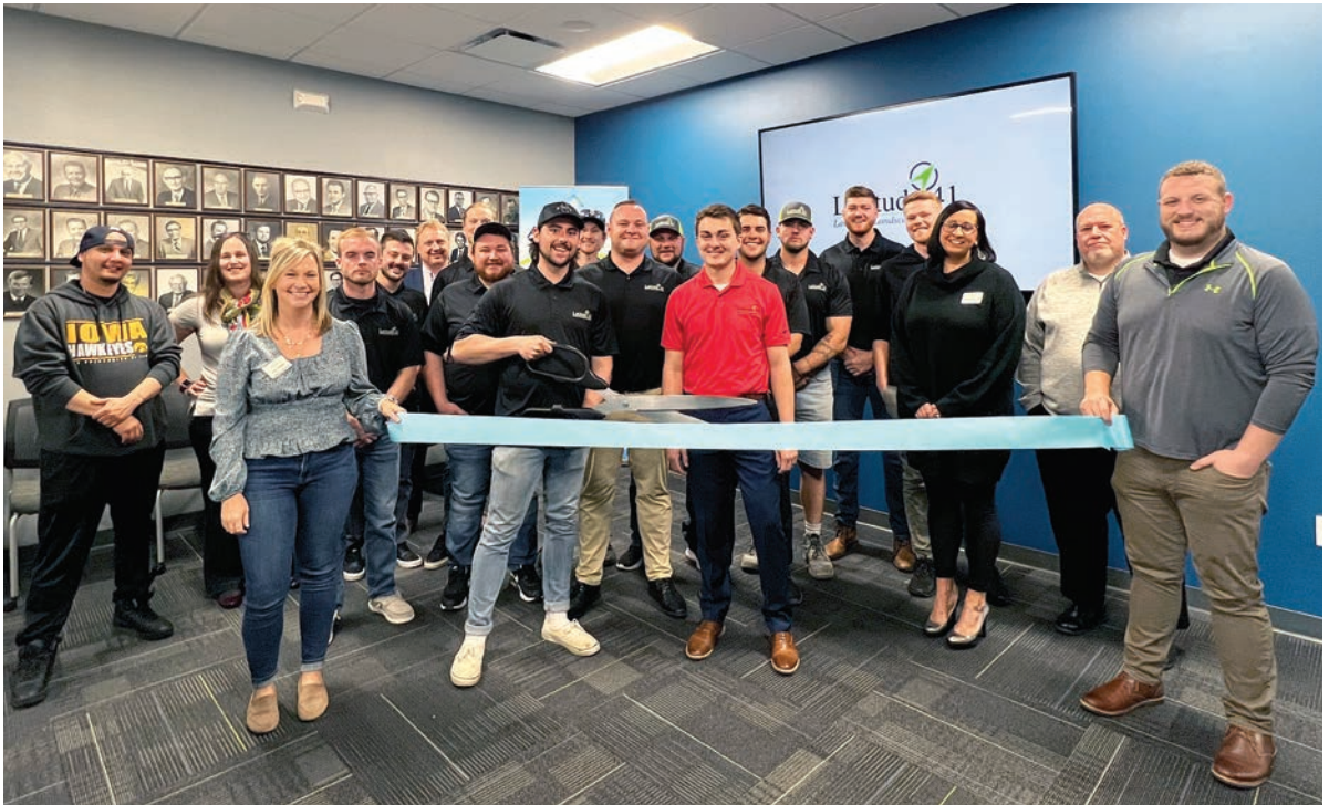
The Ankeny Area Chamber of Commerce held a ribbon cutting for Latitude 41 Lawn and Landscape Services of Iowa at the Chamber office on April 26.