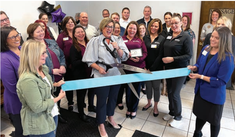
The Ankeny Area Chamber of Commerce held a ribbon cutting for Home Instead at 7017 Hickman Road, Urbandale, on April 7.