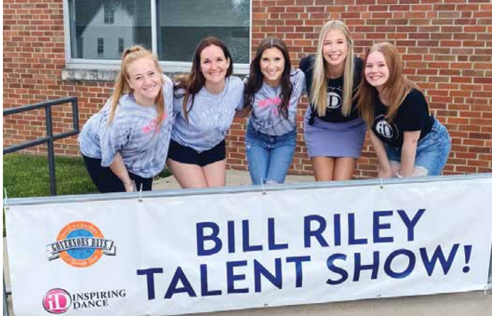
The Bill Riley Talent Show returns.

Friday's schedule includes the return of the Bill Riley Talent Show. Signups run from 11-11:45 a.m., with the show scheduled from noon to 3 p.m. at the Grimes Community Complex gym. Registration is also available online through the Governors Days website, www.governorsdays.com .