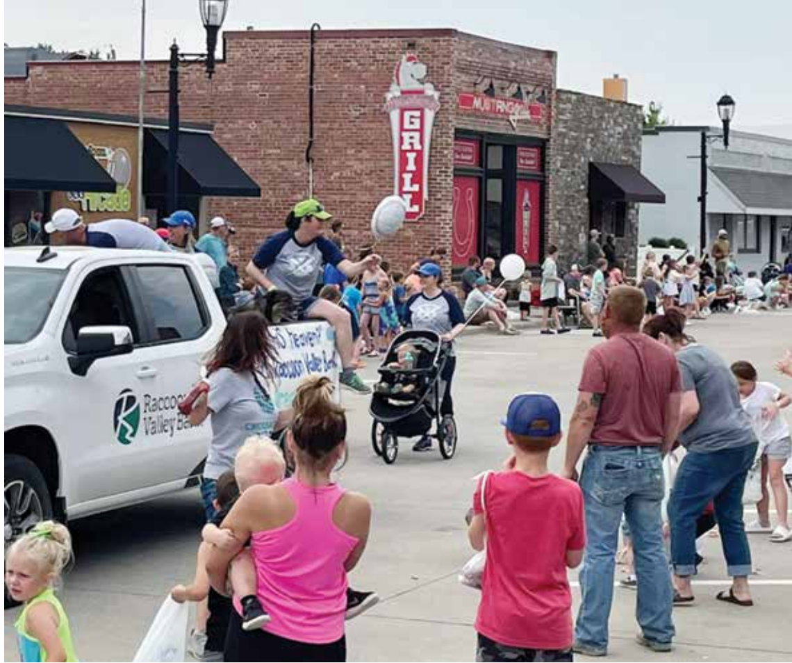
Governors Day features a Kiddie Parade and Grand Parade.

The evening continues with the family-favorite kiddie parade. While the parade previously ran from the Grimes Community Complex to Waterworks Park, this year it will begin at the Grimes Community Complex on Main Street and end at the sports complex. Children are encouraged to dress in their favorite costumes.