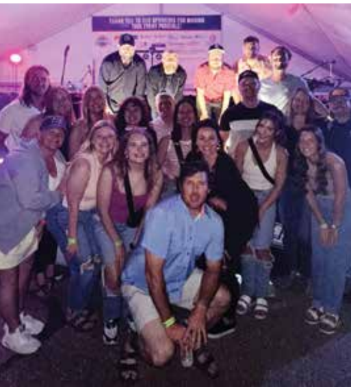
The Entertainment Garden features live entertainment and a place to relax.

Parent, begins at 10 a.m. The route returns to its traditional format, starting at South James Street and Southeast Sixth Street, traveling east and north along Southeast Trail Ridge Road, then west on Southeast Second Street. A sensory-friendly zone will be designated along the final block from Main Street to Ewing Street, with no lights or sounds.