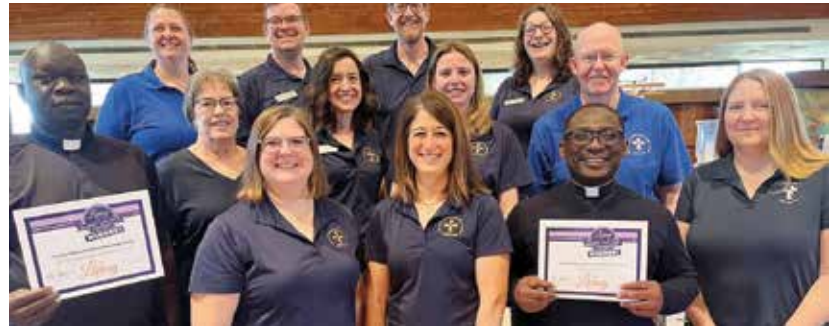
The staff and pastors at Our Lady's Immaculate Heart Church

THANK YOU FOR VOTING US FAVORITE CONTRACTOR/ CONSTRUCTION SERVICES/ REMODELING