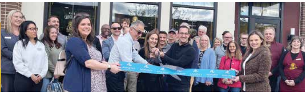
Chocolaterie Stam, 2405 S.W. White Birch Drive, Suite 107, held a ribbon cutting on April 30 with the Ankeny Area Chamber of Commerce.