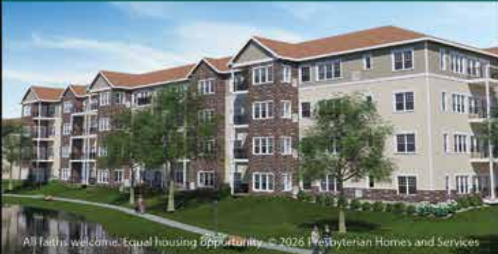
All faiths welcome. Equal housing opportunity. © 2026 Presbyterian Homes and Services

New senior apartments at Mill Pond coming in 2026