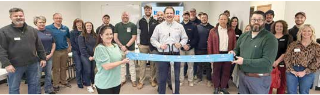
Baxter Heating & Air, 6864 N.E. 14th St., held a ribbon cutting ceremony on April 1 with the Ankeny Area Chamber of Commerce.