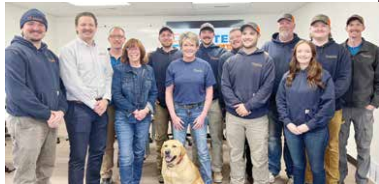
The Baxter Heating & Air team, pictured with Dewey, their loyal office dog and daily source of smiles.