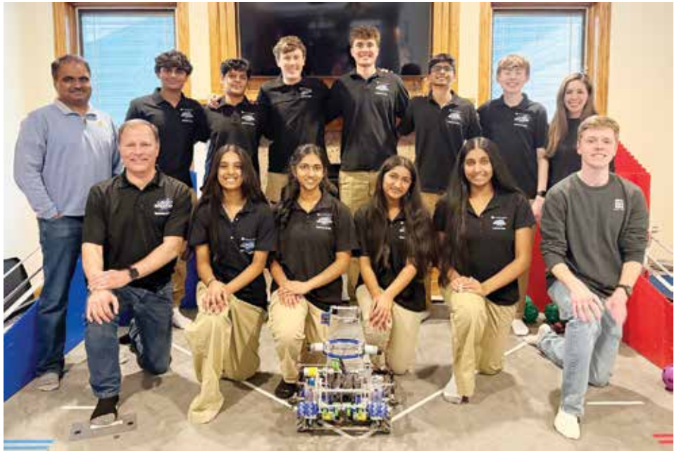
The Circuit Breakers team and their coaches pose for a photo with their robot.

"This is a world competition. Having a lot