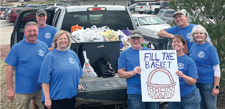
The Adel Kiwanis Club received 400 pounds of donated food for the Good Samaritan Food Pantry from Easter Egg Hunt attendees.