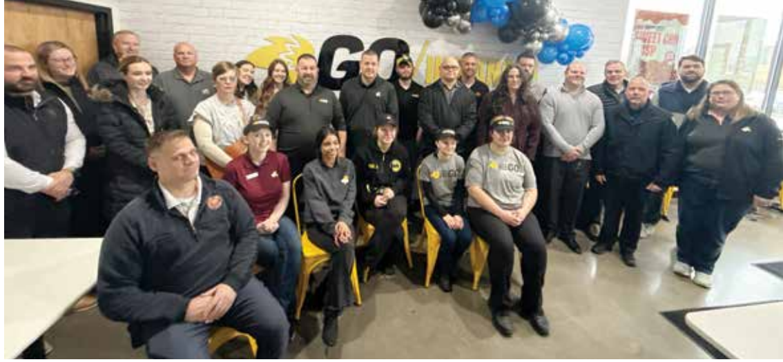
The crew at the ribbon cutting for Buffalo Wild Wings Go on March 11.

A ribbon cutting was held at Buffalo Wild Wings Go on March 11.