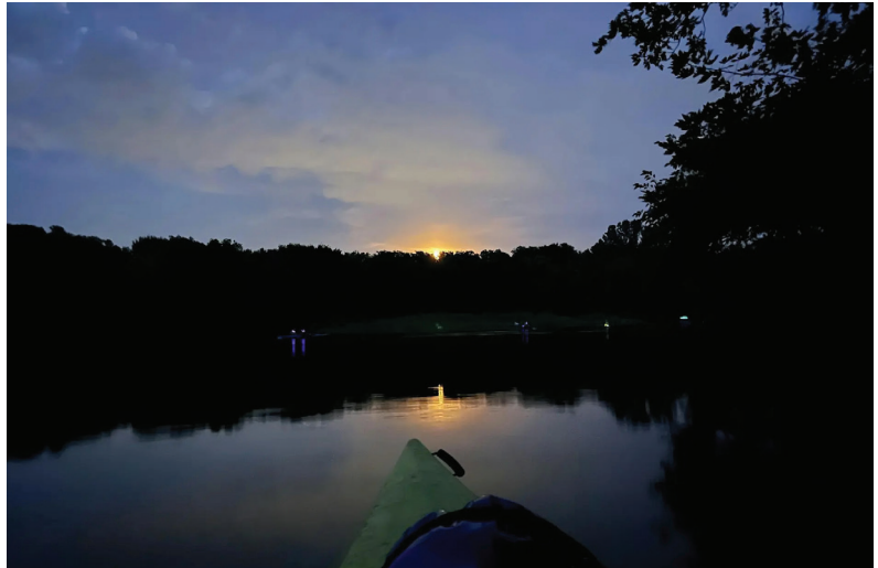
The Full Moon Float is Friday, May 29, 8:30-10 p.m.