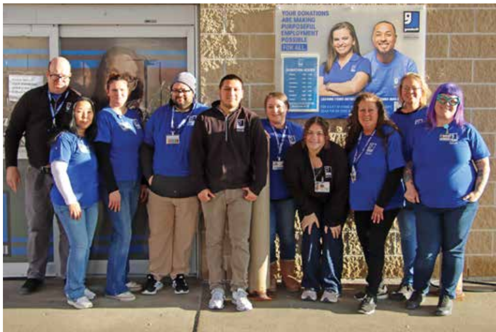
Goodwill staff at Jordan Creek in West Des Moines.

Runners up: Grassy Knoll Lawn Care, LLC; Legacy Outdoors