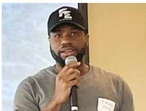
FE Studios - Fred Ebong