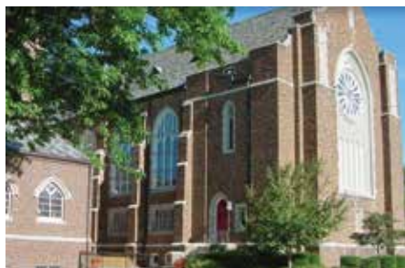
WESTMINSTER PRESBYTERIAN CHURCH

2332 Euclid Ave. 515-279-2558 www.dsmlvc.org