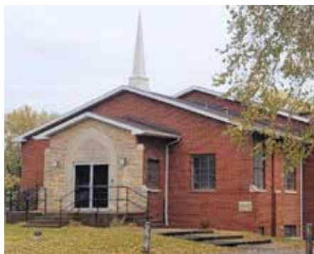
RESURRECTION COMMUNITY CHURCH OF THE NAZARENE