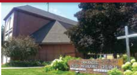
IMMANUEL UNITED METHODIST CHURCH

2900 49th St. 515-277-1100 www.immanueldsm.org