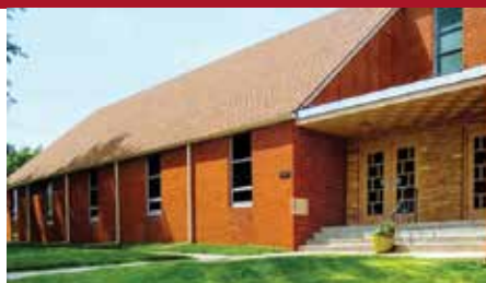
GLEN ECHO CHRISTIAN CHURCH

2926 Beaver Ave. 515-255-3162 www.holytrinitydm.org