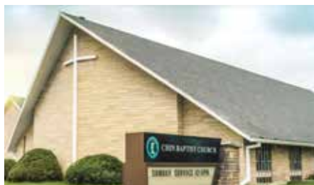
CHIN BAPTIST CHURCH

A list of churches located in the Beaverdale neighborhood and the surrounding 50310 zip code area.