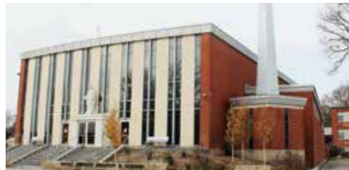
HOLY TRINITY CATHOLIC CHURCH AND SCHOOL

Holy Trinity offers preschool through eighth-grade education. Each grade in kindergarten through eighth has two sections, allowing the average classroom size to remain small. Staff works hard to create a rigorous academic curriculum that challenges every student, while also offering support at all levels to ensure every student has the opportunity to reach their potential.