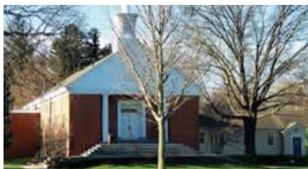
SAINT ANDREW'S EPISCOPAL CHURCH

5720 Urbandale Ave. 515-255-2101 www.standrewsdsdm.org