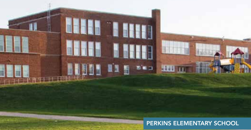
PERKINS ELEMENTARY SCHOOL