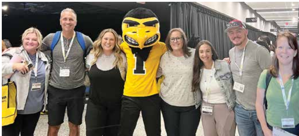
The ADM counseling team supports students in a number of ways.

Every ADM student receives intentional support along the way. Younger learners benefit from monthly counseling lessons, while middle school students participate in sessions during Tiger Time. The district