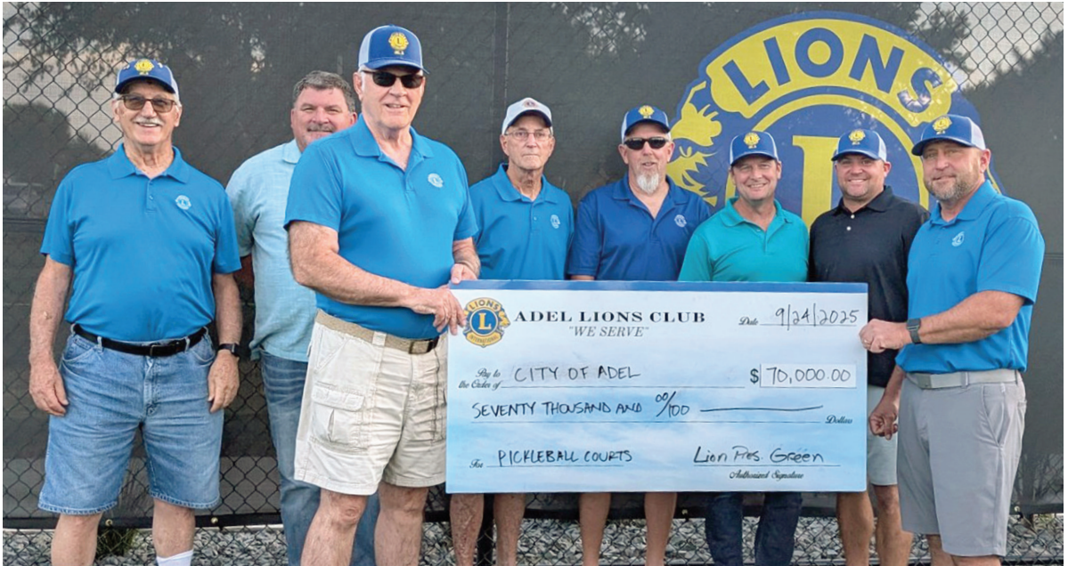
The Adel Lions Club donated $70,000 to the city of Adel for the construction of pickleball courts in Evans Park. The ceremonial check presentation was Sept. 24. ■