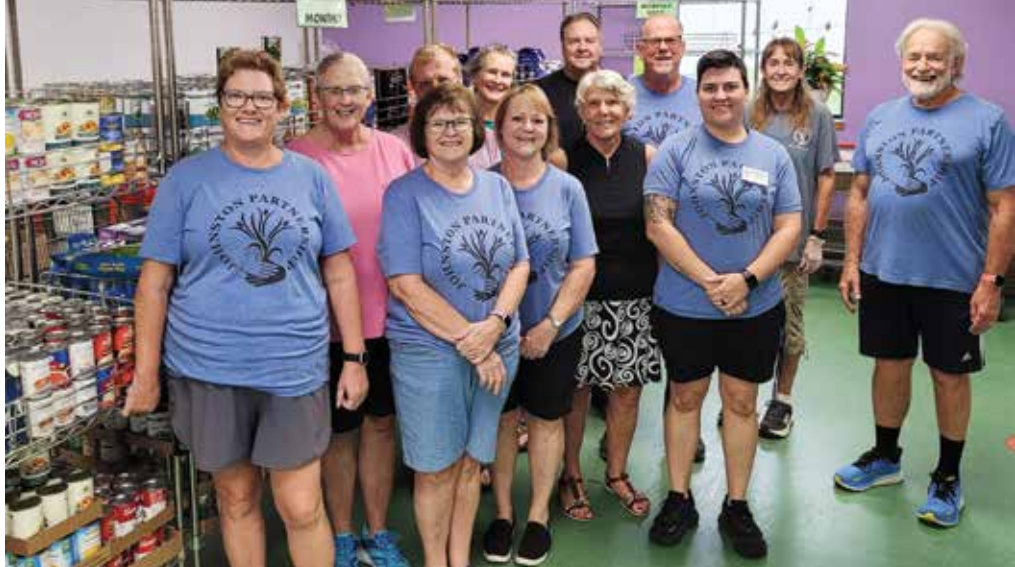
Staff and volunteers of Johnston Partnership, voted among the favorite nonprofits in the area.