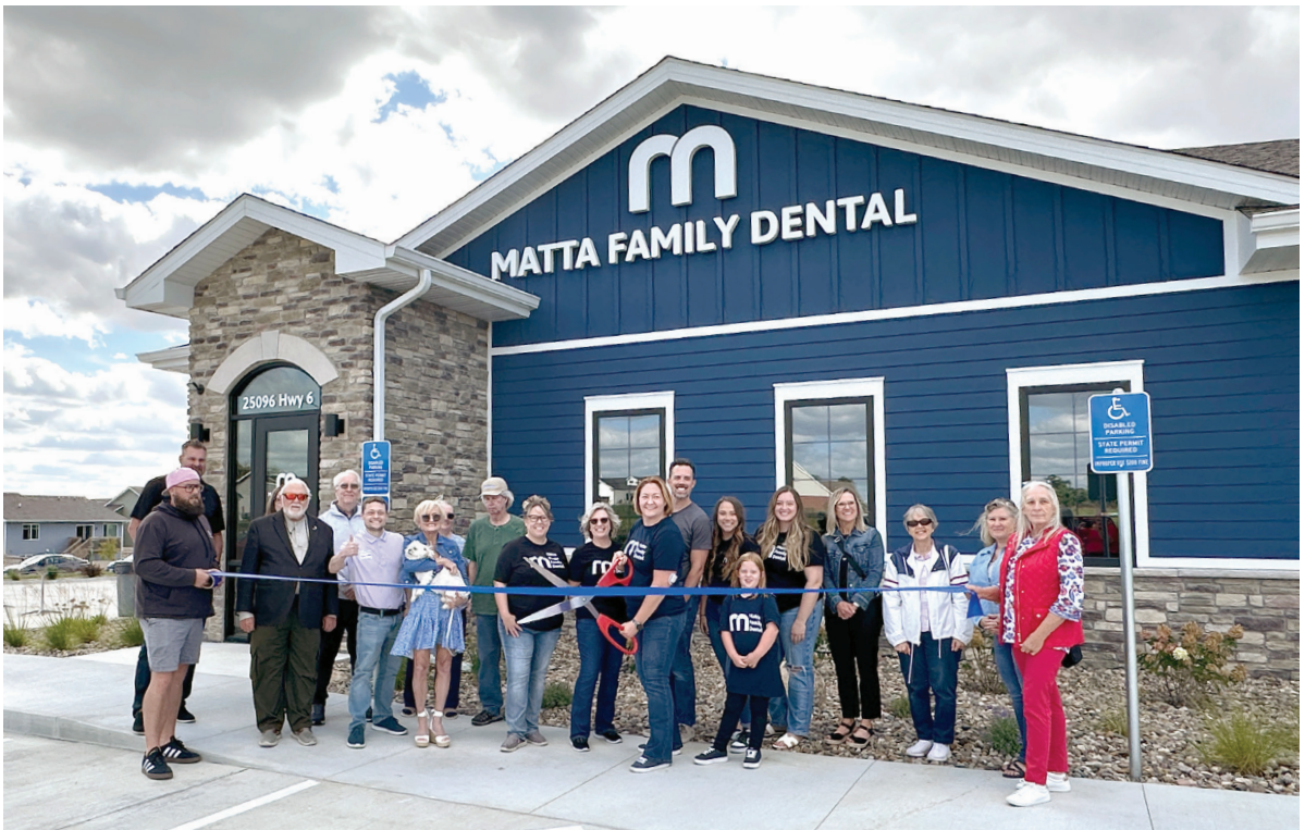
Matta Family Dental held a ribbon cutting at its new facility, 25096 Highway 6 in Adel, on Sept. 18. ■