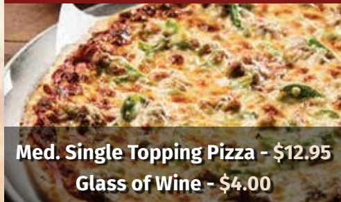
Med. Single Topping Pizza - $12.95 Glass of Wine - $4.00