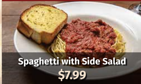
Spaghetti with Side Salad $7.99