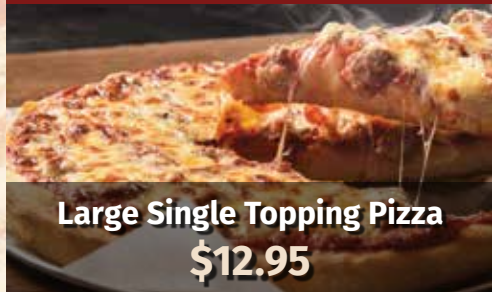
Large Single Topping Pizza $12.95