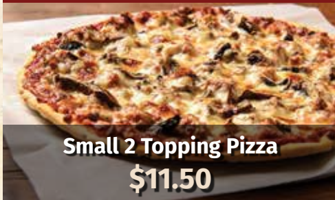
Small 2 Topping Pizza $11.50