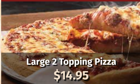
Large 2 Topping Pizza $14.95