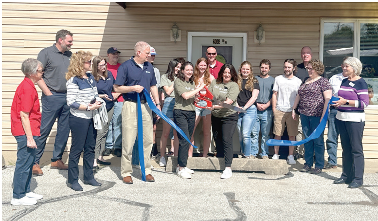
The Adel Partners Chamber held a ribbon cutting for Salt and Light Massage, 203 Nile Kinnick Drive S., on May 7. ■